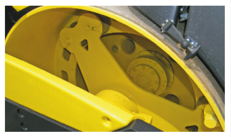
Direct drum drive with vibrating travel speeds of 4.5 mph available. Individually serviceable isolators without drum removal.