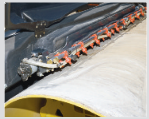
Dual, independent spray systems per drum, with quick-disconnect nozzles, ensure continuous waterspray operation. Spray pattern protected by hinged, swing-up wind deflection covers.