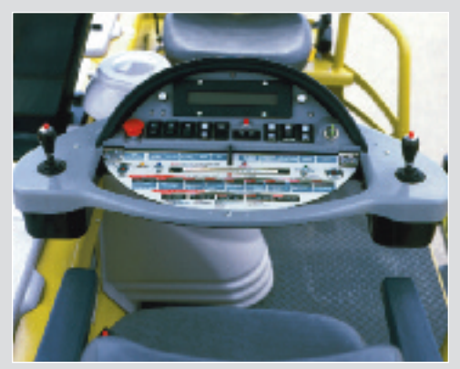
Operator's control panel is fully adjustable to either seating position. Simplified controls make operation easy to novice, as well as experienced operators. Display panel provides all necessary, as well as critical information for proper machine operation and professional results.

With these features and many more, it's easy to see why this model maintains a high residual value while delivering lower lifetime operating costs.