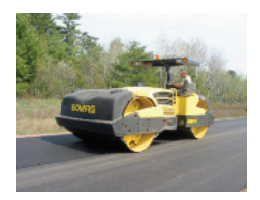
84" rolling width with available 4000 vpm frequency.