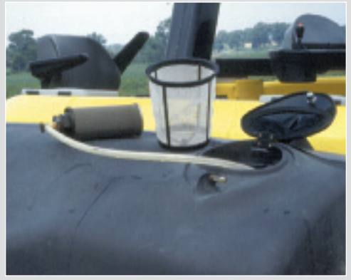
Waterspray system is further protected by fill port strainer and intank suction filtration. Fill port cover is lockable for vandal protection.