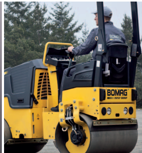
The driver's platform with the feel-good factor – roomy, safe and comfortable.