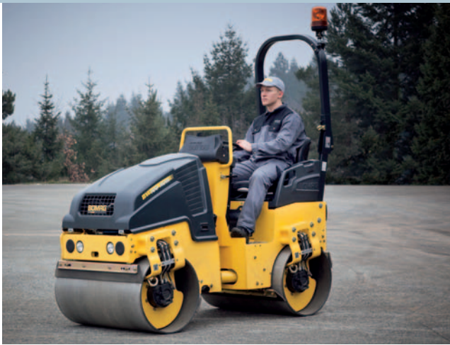
Arguably the toughest rollers in the world ...