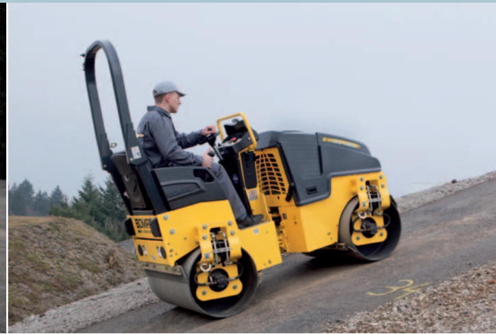
... the masters of granular and asphalt compaction.