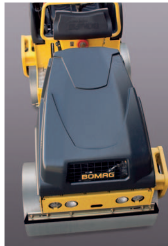
100% “clear-sided” models with drums free on one side giving an offset of 60 mm.