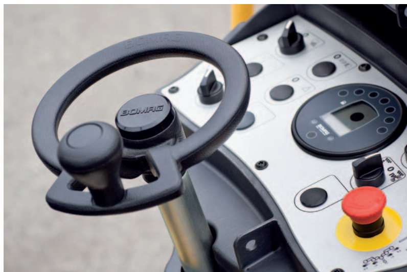
The clearly laid out dashboard and the Smart Drive steering wheel for intuitive and safe operation.