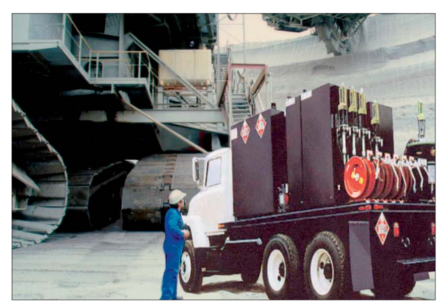
Lubrovan Service Truck with Hydraulic PowerMaster III Pumps

These pumps are versatile – as a centralized lubrication pump for progressive, single-line or two-line systems; for lubrication of breaker hammers; or for manually activated