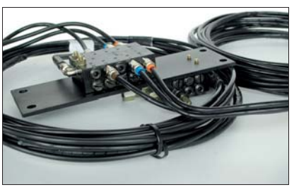
Lincoln offers the possibility to reduce installation cost with pre-assembled kits A considerable advantage for OEMs!