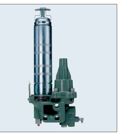
HTL 429 Pump

The pump supplies a predetermined quantity of lubricant every time the hydraulic equipment is activated. The quantity is adjustable via 4 different metering screws (0.1 cm<sup>3</sup>, 0.2 cm<sup>3</sup>, 0.3 cm<sup>3</sup>, 0.5 cm<sup>3</sup>). The pump is equipped with a visual level control that shows when it is empty.