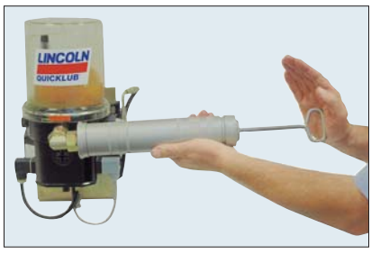
Filling of Quicklub Pumps: Fast & Easy

• Installation can be performed with threaded or 350 bar rated Quicklinc plug-in type fittings.