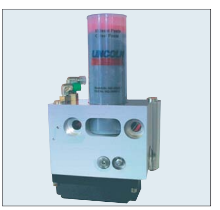
HTL 101 Pump

The HTL 101 lubrication pump is driven by the machine's on-board hydraulic system. Extra drives, auxiliary power or control valves are all redundant. The HTL-101 mounts directly on the accessory, minimizing tubing and drastically reducing installation costs.