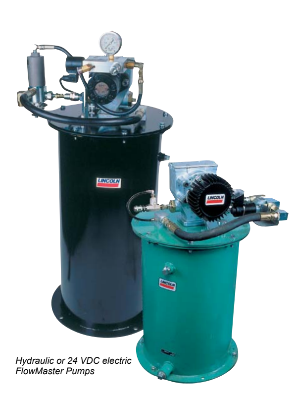
FlowMaster Pump Station