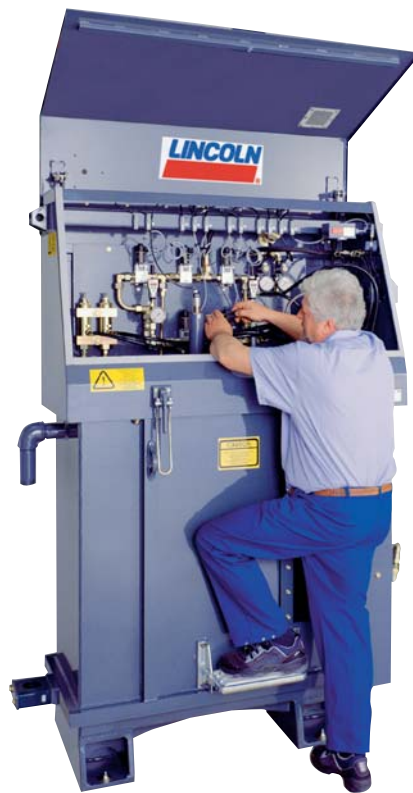
600 Liter Pump Station